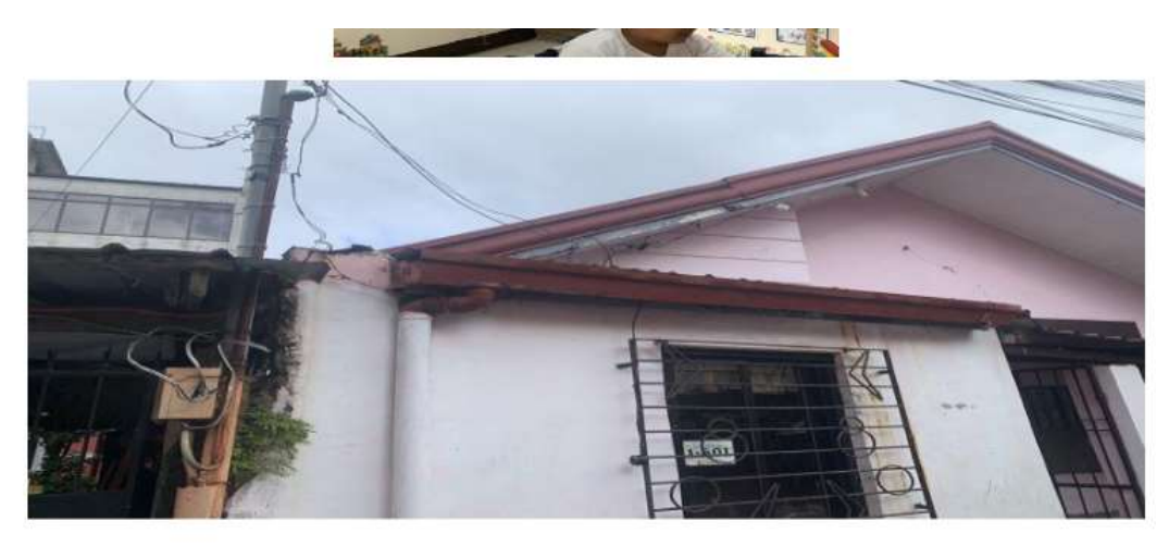
BRGY 2 - MAYTOONG CHILD DEVELOPMENT CENTER