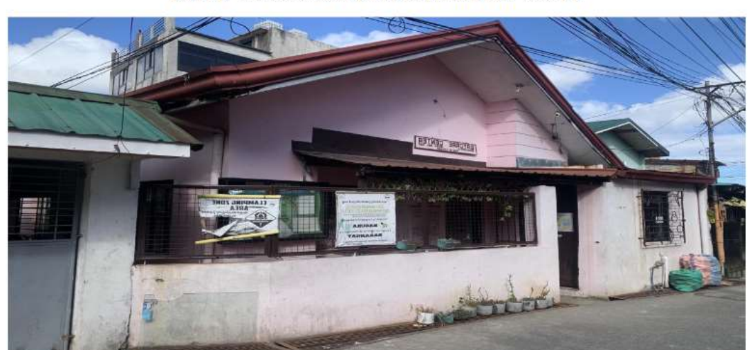
BRGY 1 - IBABA DEL SUR CHILD DEVELOPMENT CENTER

[Insert here a list of Drawings. The actual Drawings, including site plans, should be attached to this section, or annexed in a separate folder.]