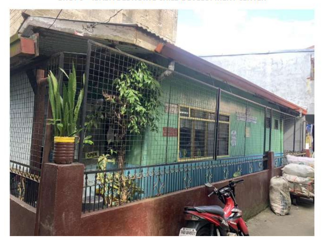
BRGY 9 - IBABA DEL NORTE CHILD DEVELOPMENT CENTER