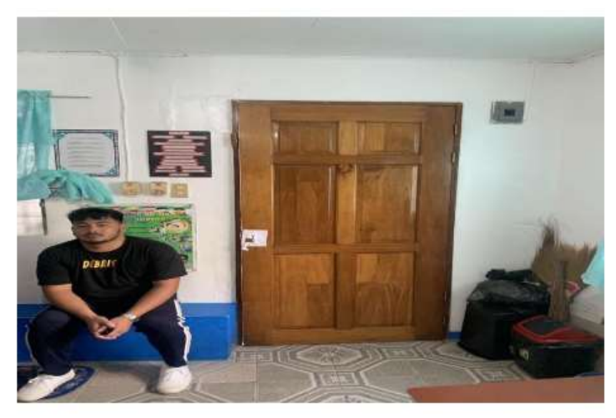
BRGY 6 - ILAYA DEL NORTE CHILD DEVELOPMENT CENTER