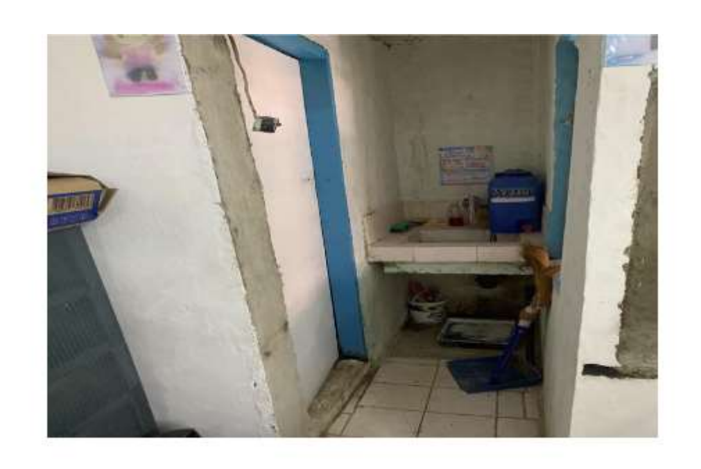
BRGY 5 - ILAYA DEL SUR CHILD DEVELOPMENT CENTER