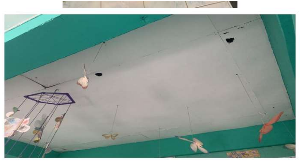
BRGY 3 - ERMITA CHILD DEVELOPMENT CENTER