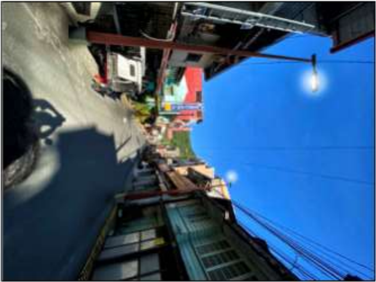
F. SARIO ST.