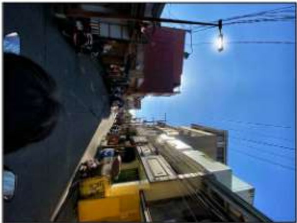
J.V. QUESADA ST.